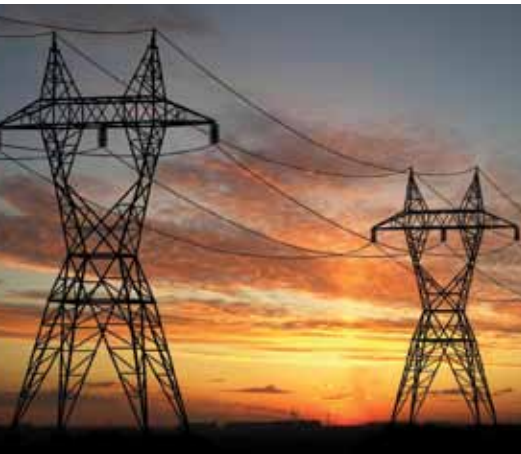
energy and utilities