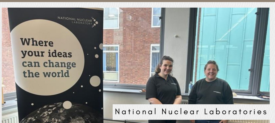
National Nuclear Laboratories